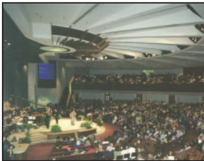
2002 Inaugural Jerusalem Prayer Summit