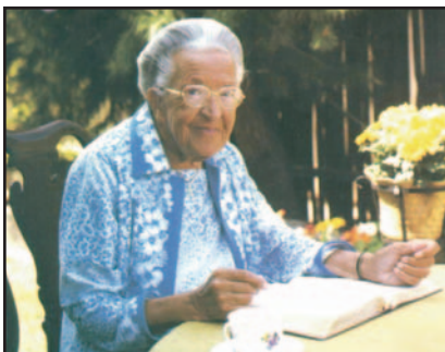
Corrie ten Boom