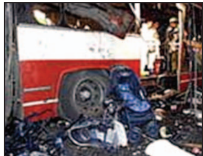
The aftermath of a suicide bombing in Israel.

The Corrie ten Boom Fellowship and its sister organization, The Corrie ten Boom Foundation of Holland, are also charged with carrying forth the vision of the ten Boom Family. Specifically, that vision is to care for and protect the Jewish